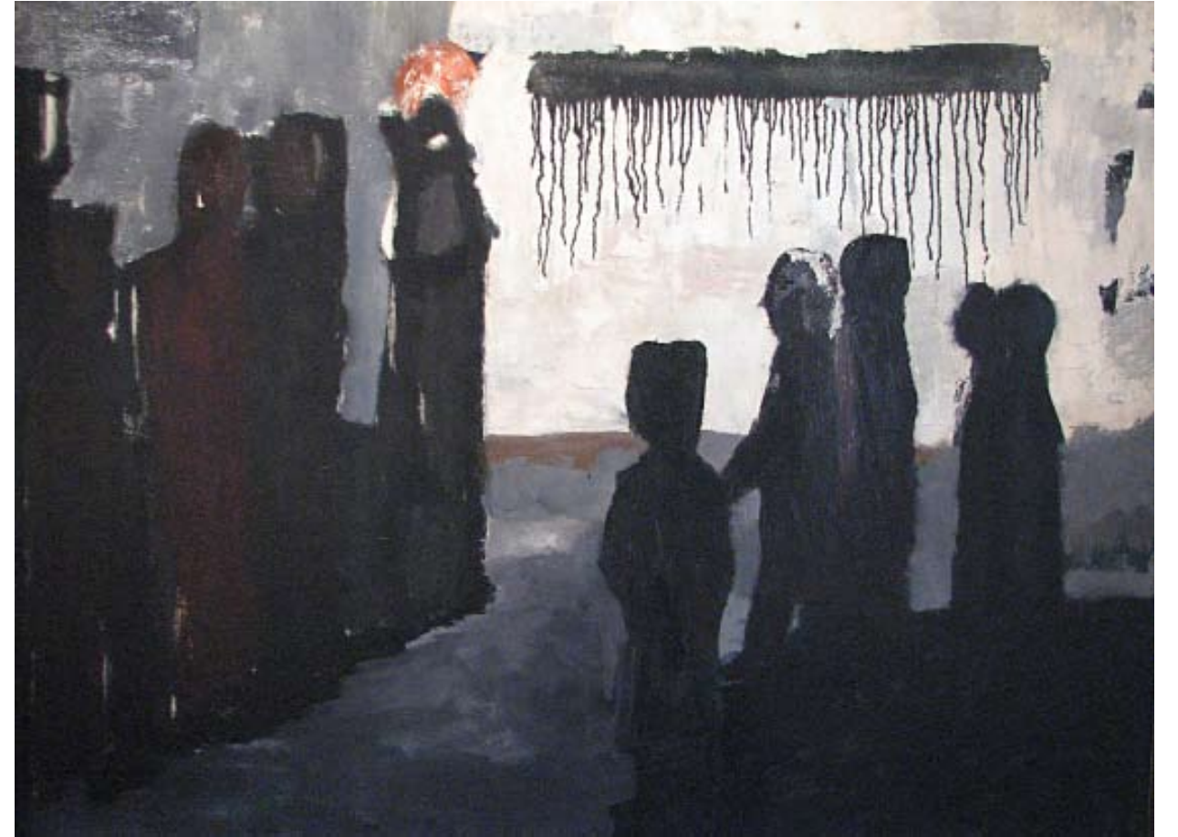
Bob Thompson Jan Muller's Funeral , 1958, oil on board, 36 x 42 inches