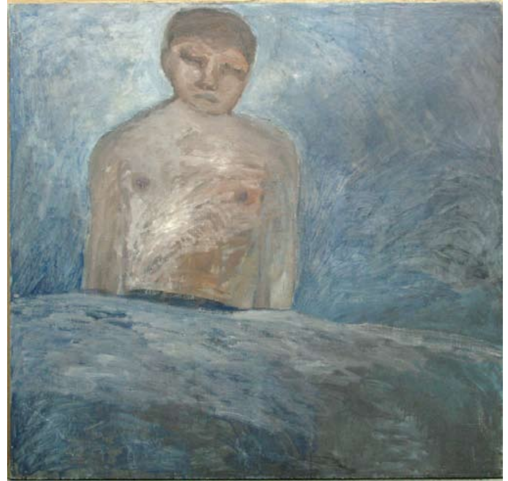
Gandy Brodie Young Bather , 1956, oil on masonite, 49 x 46 1/2 inches