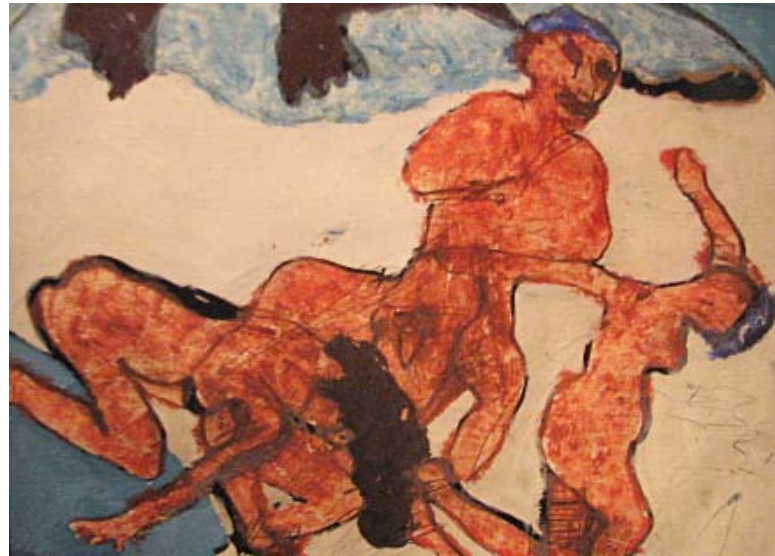
Bob Thompson Dawn , 1964, ink & gouache over print, Image size: 4 7/8 x 6 9/16 inches; Paper size: 6 5/8 x 11 1/4 inches