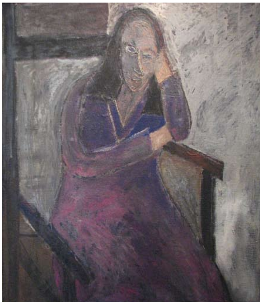
Gandy Brodie The Penetration of a Thought , 1958, oil on canvas, 47 1/2 x 47 1/2 inches