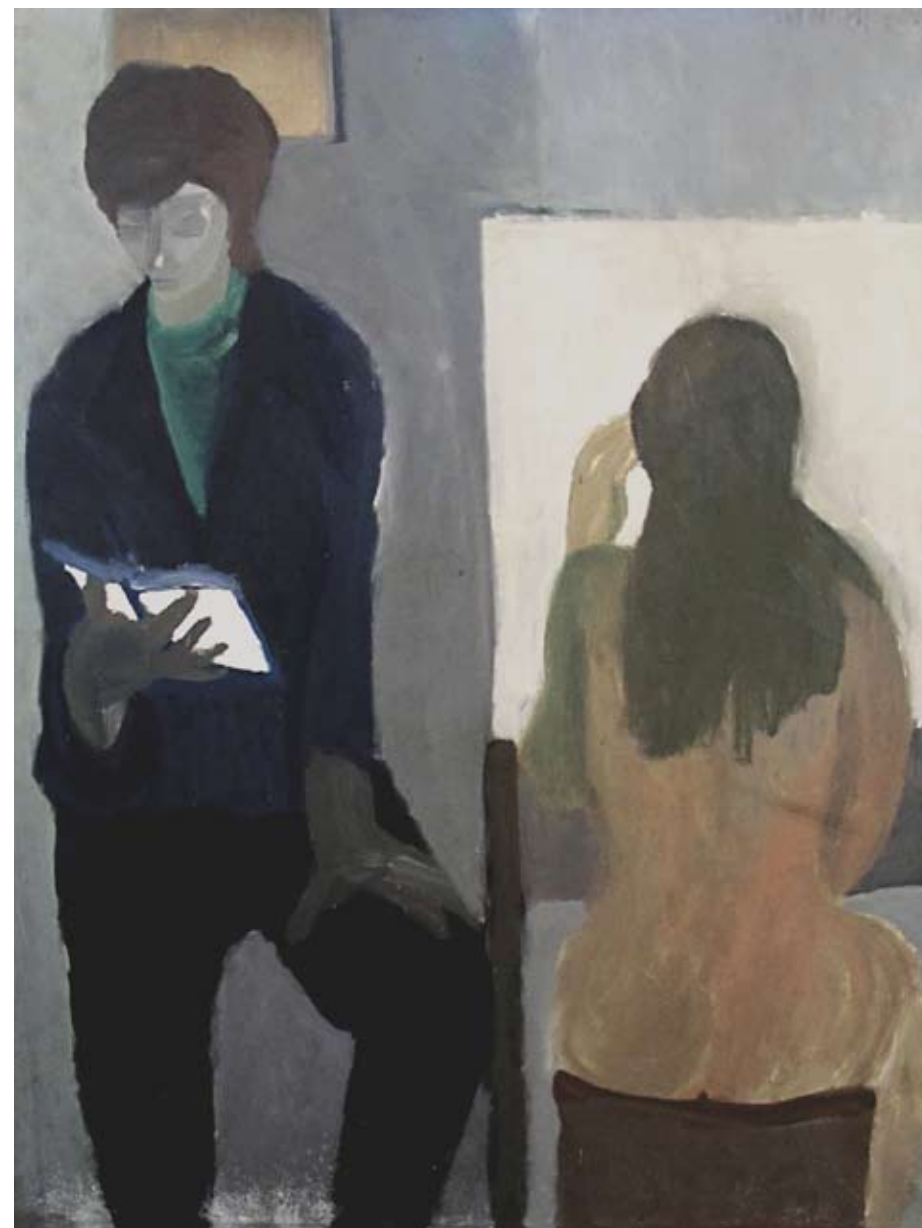
Bob Thompson Differences , 1958, oil on canvas, 62 x 46 inches