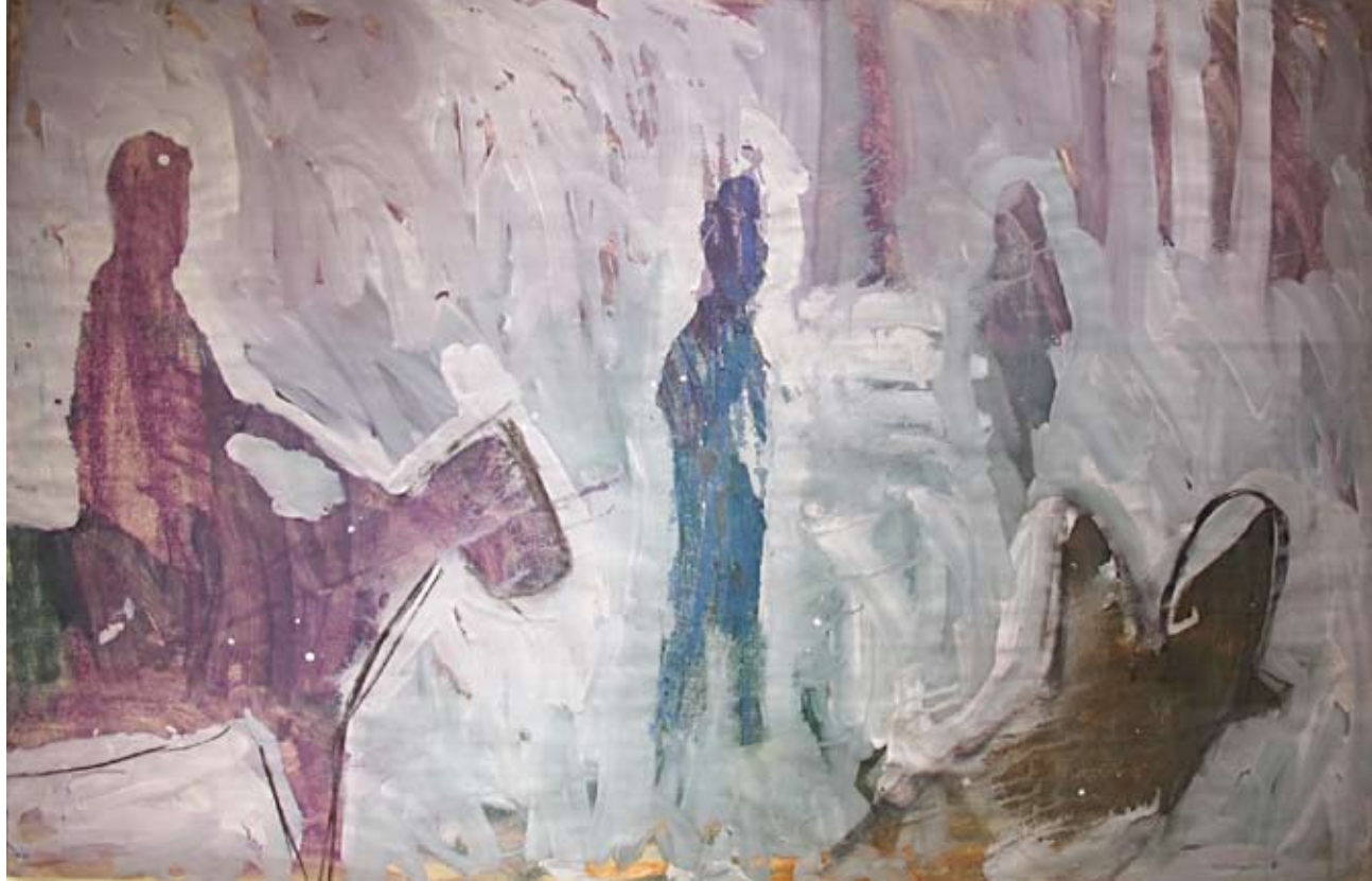
Bob Thompson Search for the Unicorn , 1960, gouache, pastel and charcoal on paper, 25 1/2 x 39 1/2 inches