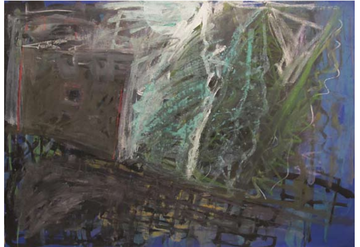
Gandy Brodie Florentine Wall and Trees , 1957-59, gouache on paper board, 26 3/4 x 37 3/4 inches