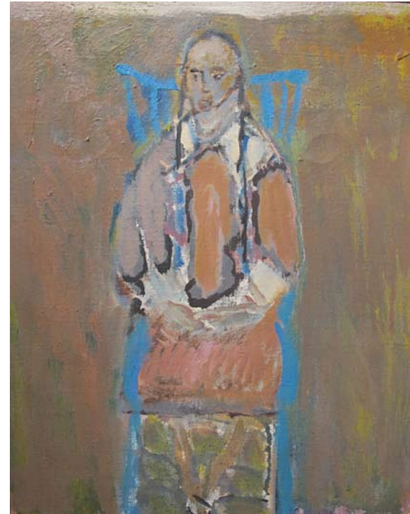
Gandy Brodie Child in a Blue Chair , 1959, oil on canvas, 20 x 16 inches