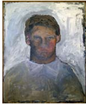
Gandy Brodie Self Portrait , 1955, oil on canvas, 30 1/8 x 24 inches (not included in exhibition)